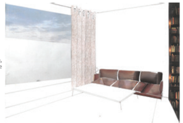
The Conventional Curtain

A grid secured to a tree creates an opportunity for a personal space shielded from the sounds of a busy park in a modern city.