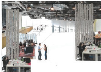
The Room Divider

When used in a home as a curtain, the Troldekt panels can isolate against both sound and light.