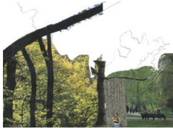
The Soundshade Pavilion

A grid secured to a tree creates an opportunity for a personal space shielded from the sounds of a busy park in a modern city.