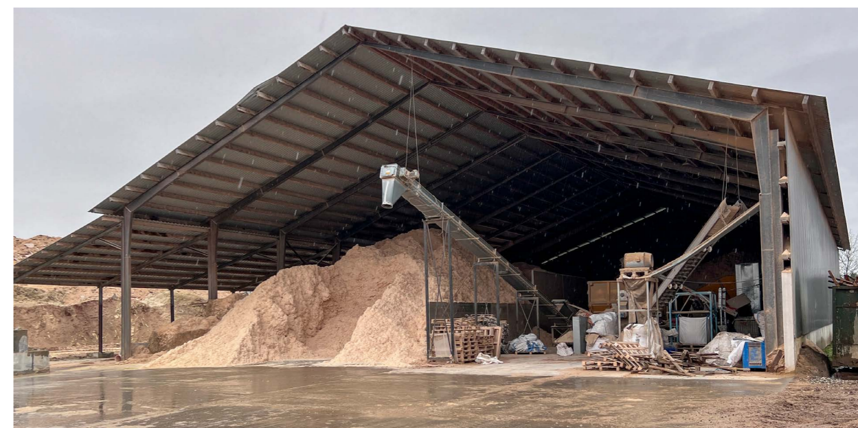
The North Trade House facility.